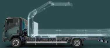
FLATBED TRUCK WITH LOADING CRANE